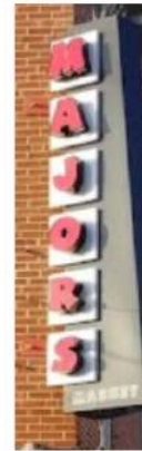
Major's Deli & Grocery