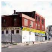
Korman Discount Store