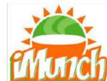
I Munch Cafe