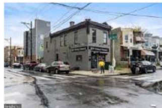
30TH Street Mini Market