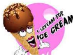
I scream for Ice cream