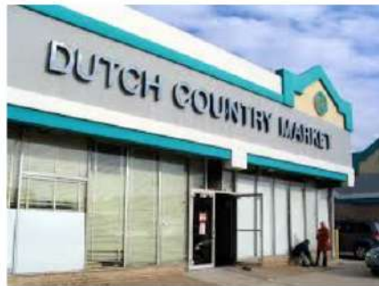
Dutch Country Market