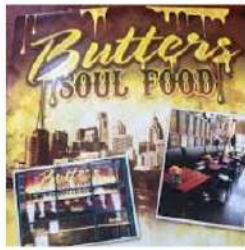
Butter Soul Food