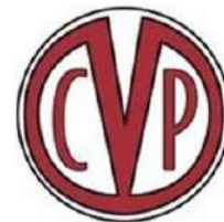
City View Pizza