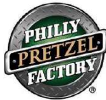
Philly Pretzel Factory