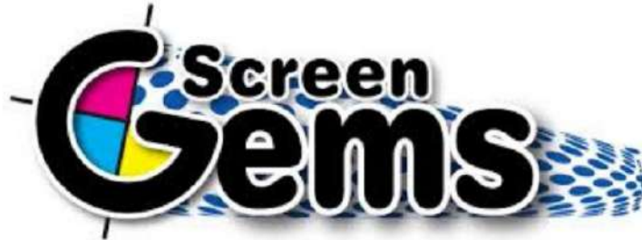
Screen Gems Inc.